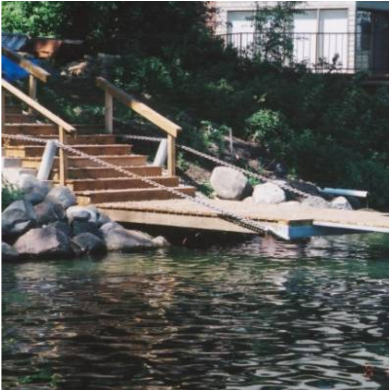
Fig. 1. Mohs lakeside pier.