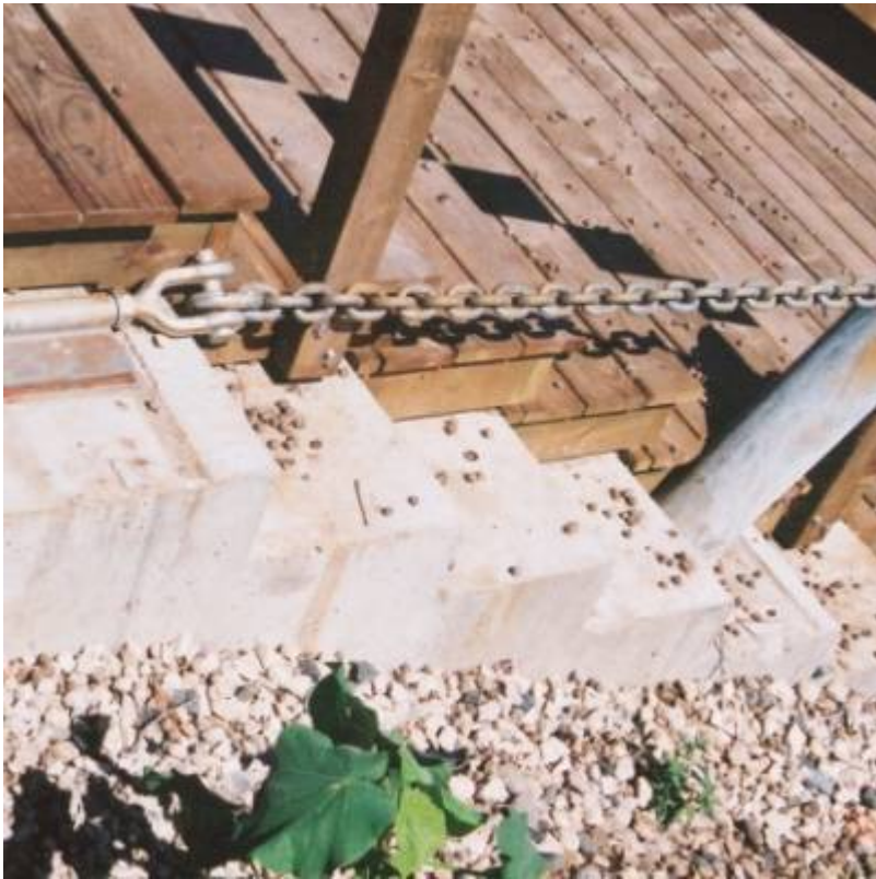
Fig. 2. Mohs lakeside pier.