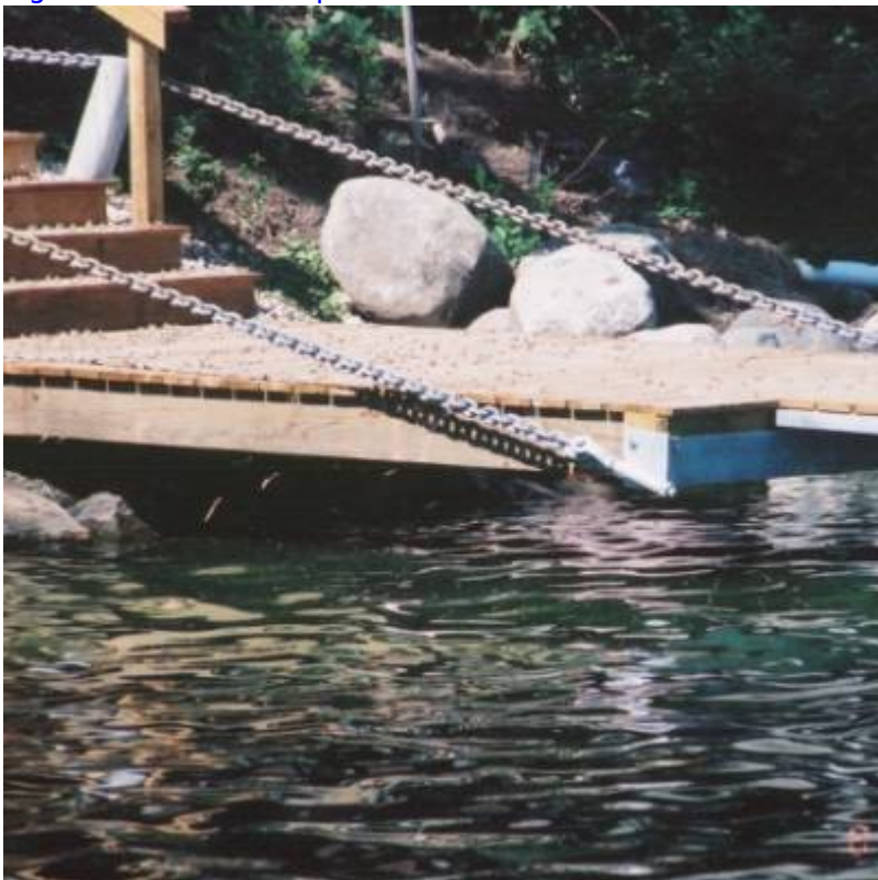
Fig. 3. Mohs lakeside pier.