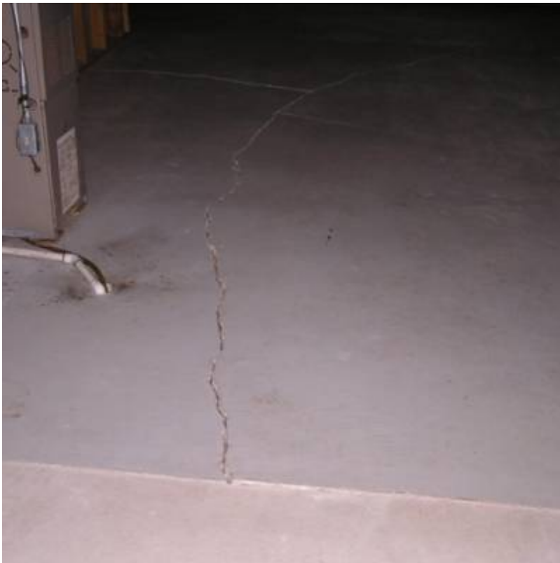
Fig. 13. 7141-43 Duplex.