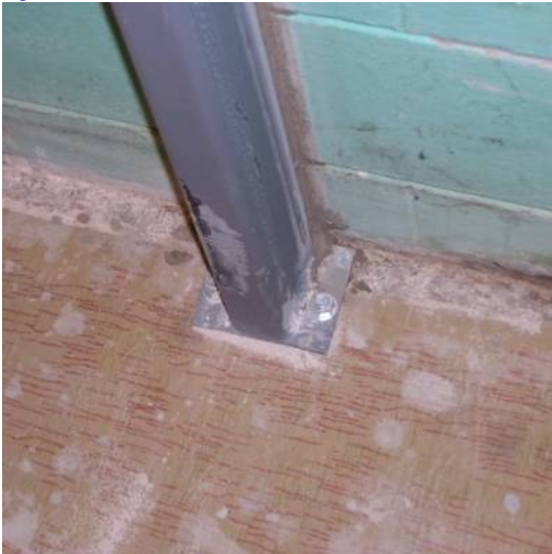
Fig. 12. 3700 Oklahoma.