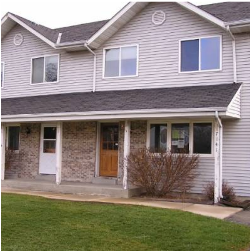
Fig. 1. 7141-43 Duplex.