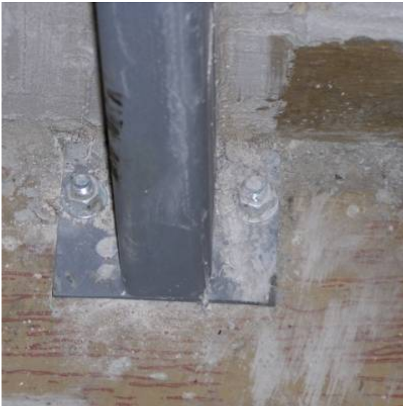
Fig. 9. 3700 Oklahoma.