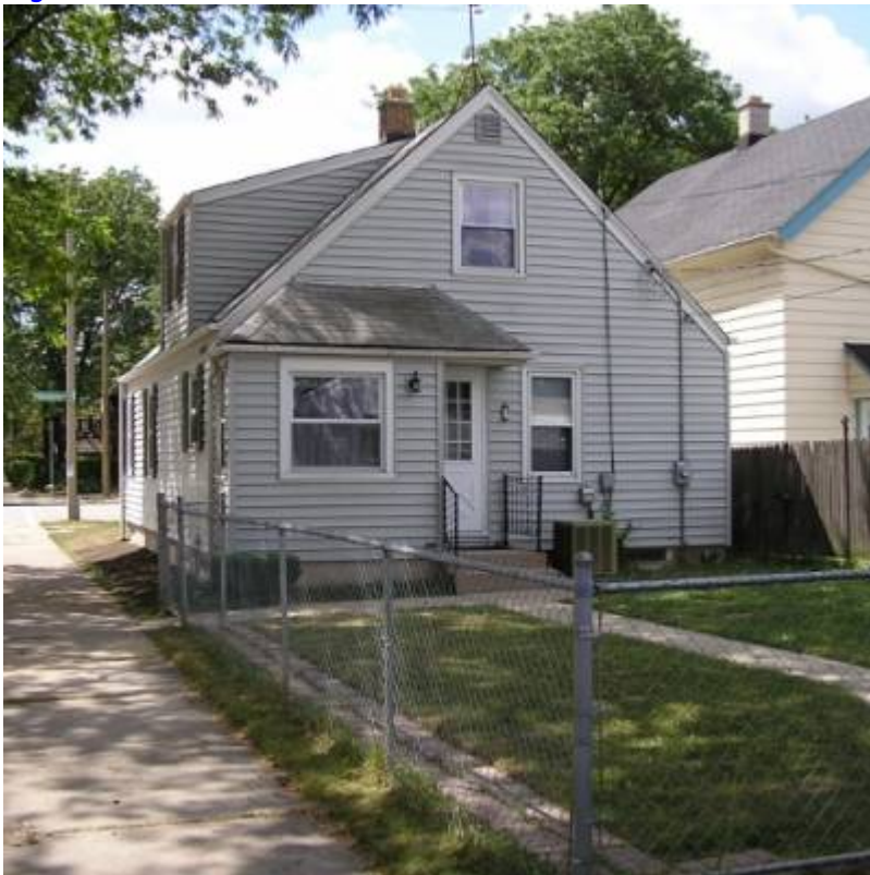
Fig. 2. 3700 Oklahoma.