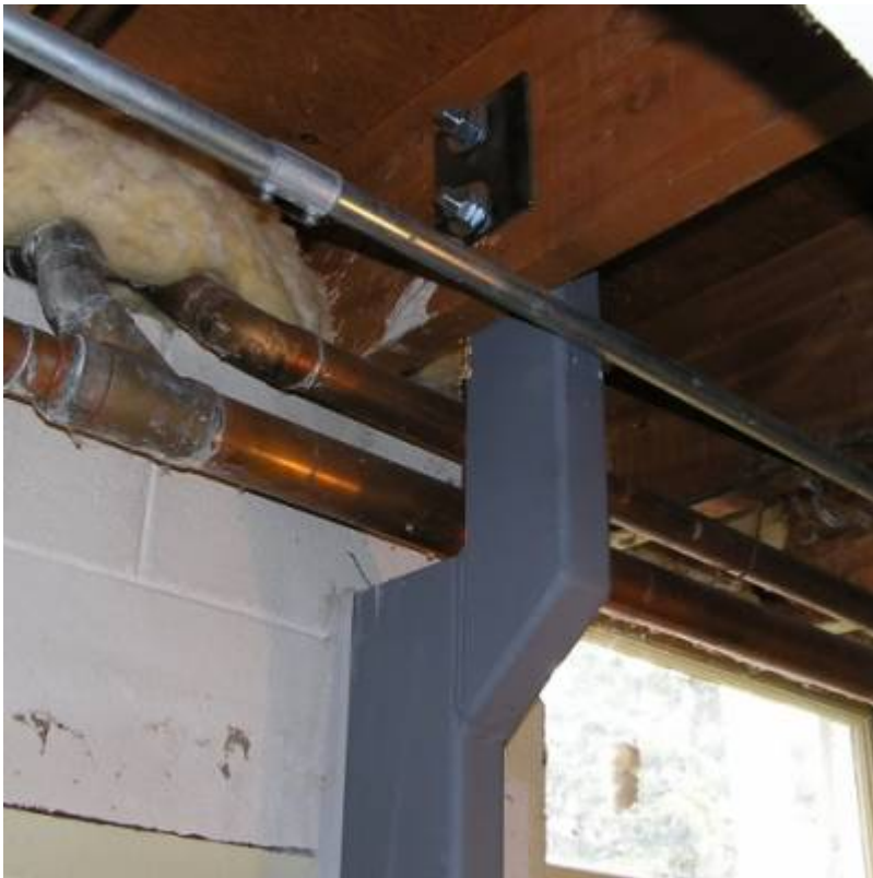
Fig. 4. Schmidt residence.