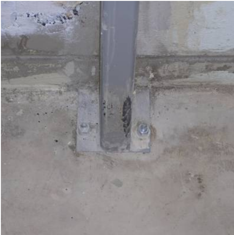
Fig. 4. Schneider residence.