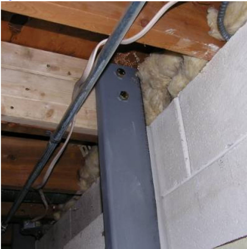
Fig. 5. Schmidt residence.