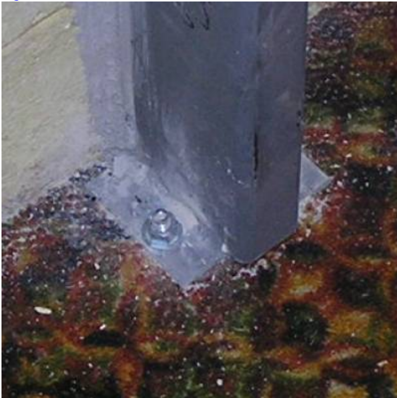
Fig. 3. Schmidt residence.