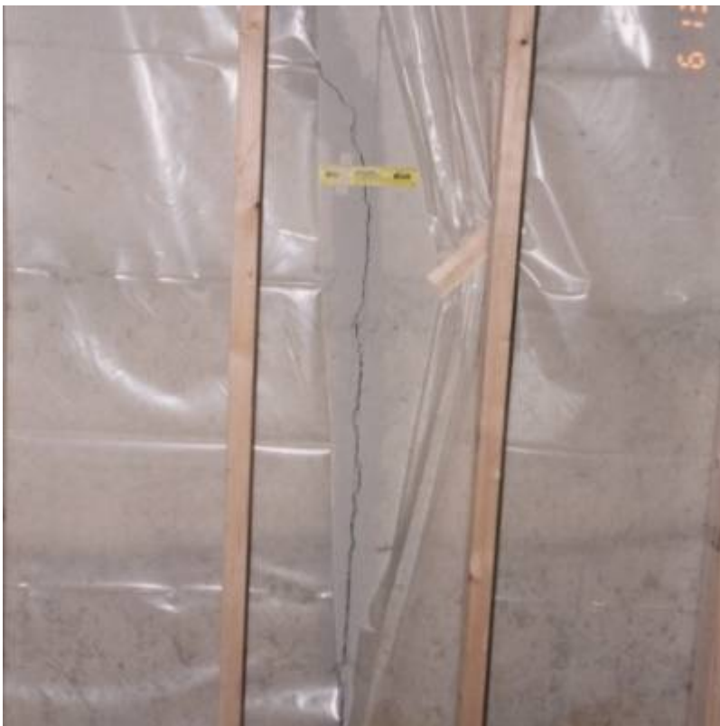
Fig. 1. Pack residence.