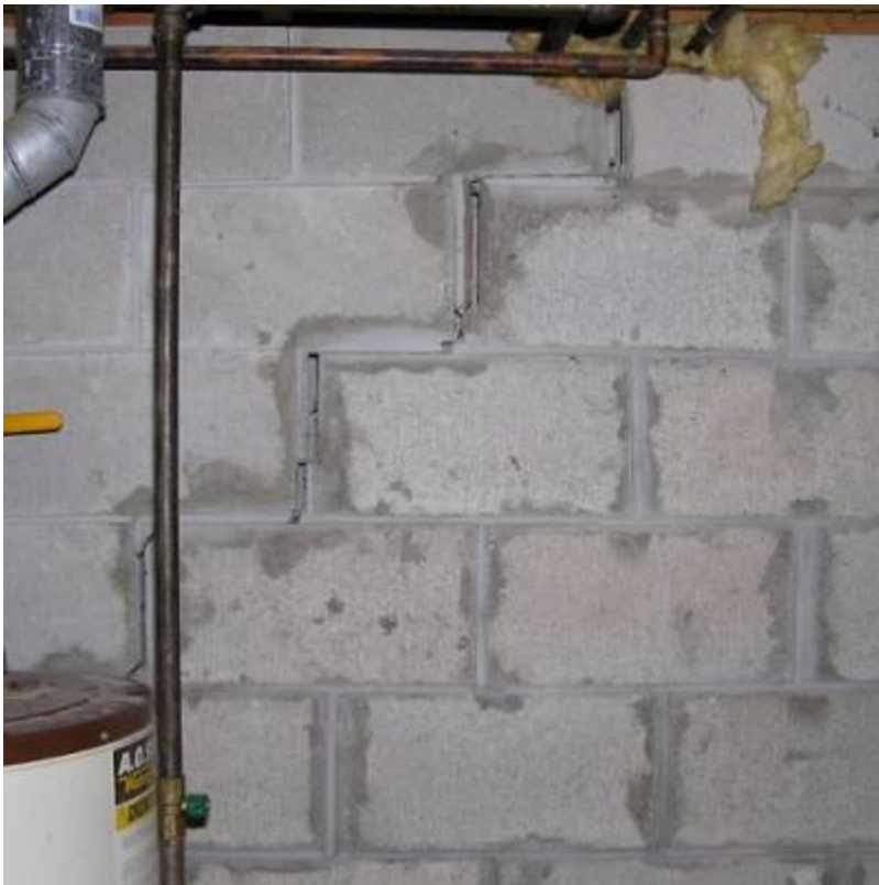
Fig. 9. 7141-43 Duplex.