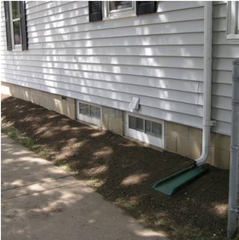
Fig. 3. 3700 Oklahoma.