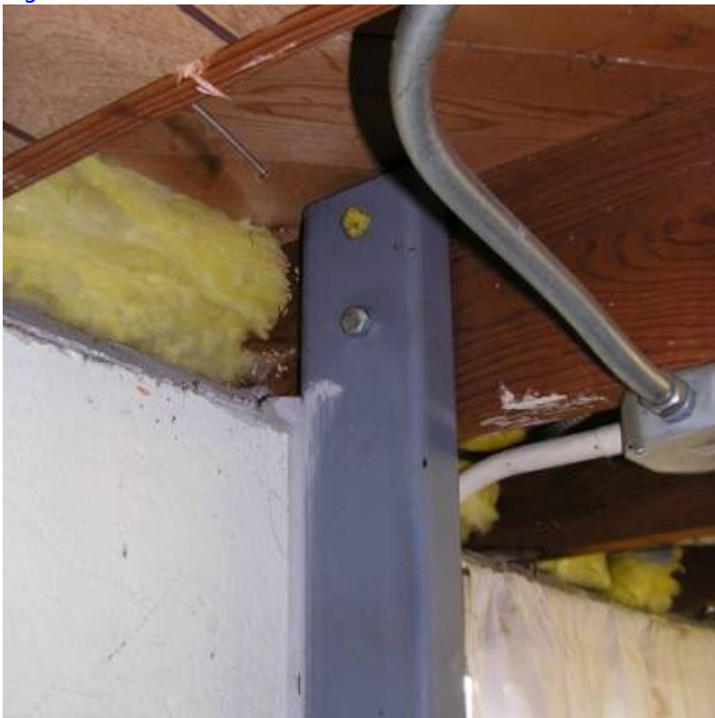
Fig. 8. 3700 Oklahoma.