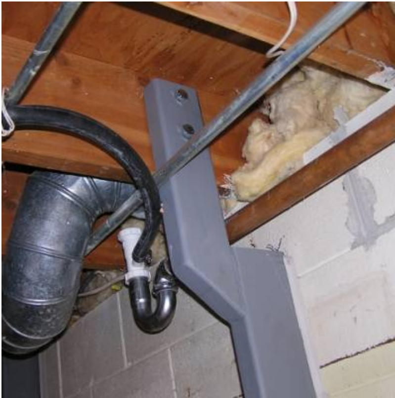
Fig. 6. Schmidt residence.