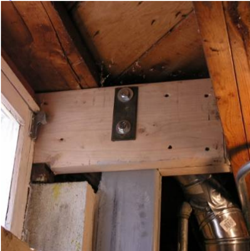
Fig. 5. Schneider residence.