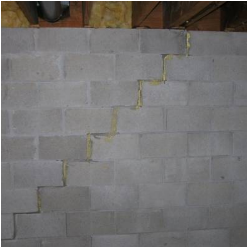
Fig. 8. 7141-43 Duplex.