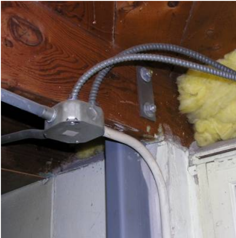
Fig. 7. 3700 Oklahoma.