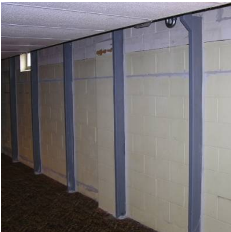
Fig. 1. Schmidt residence.