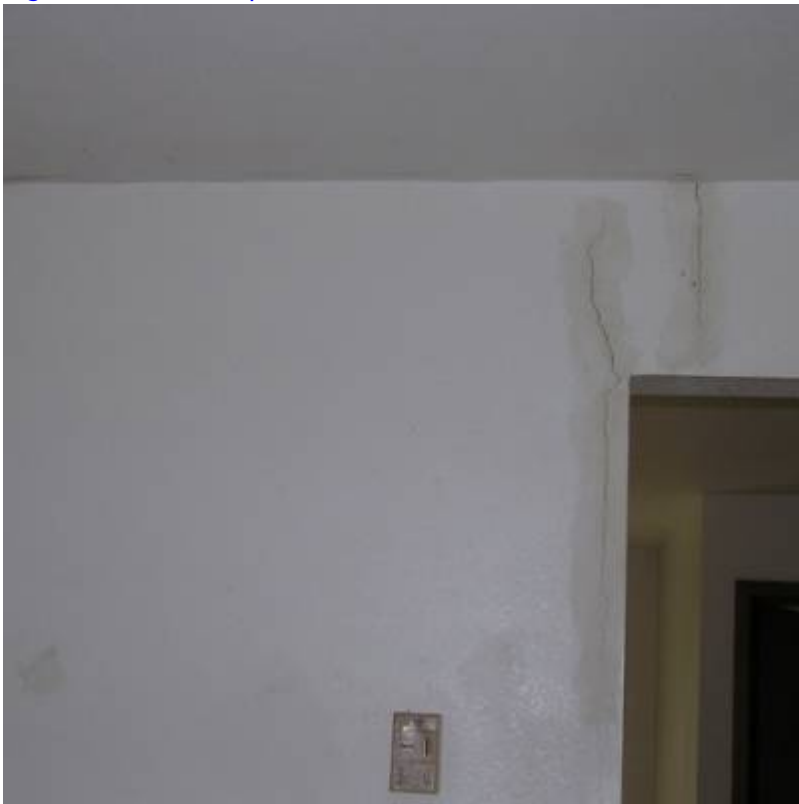
Fig. 6. 7141-43 Duplex.