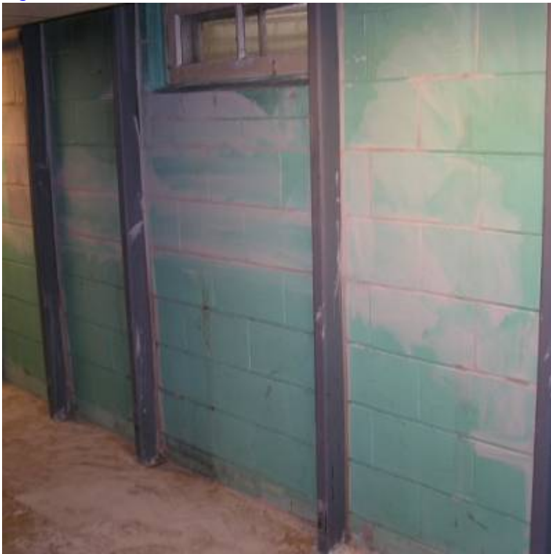
Fig. 10. 3700 Oklahoma.