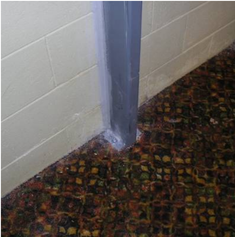
Fig. 2. Schmidt residence.