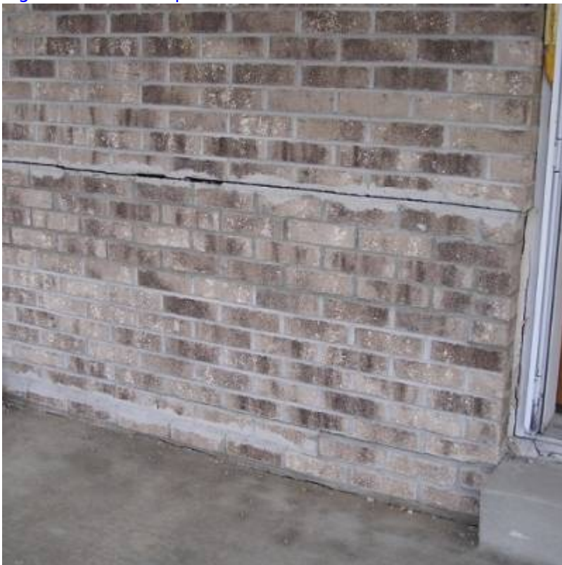
Fig. 4. 7141-43 Duplex.