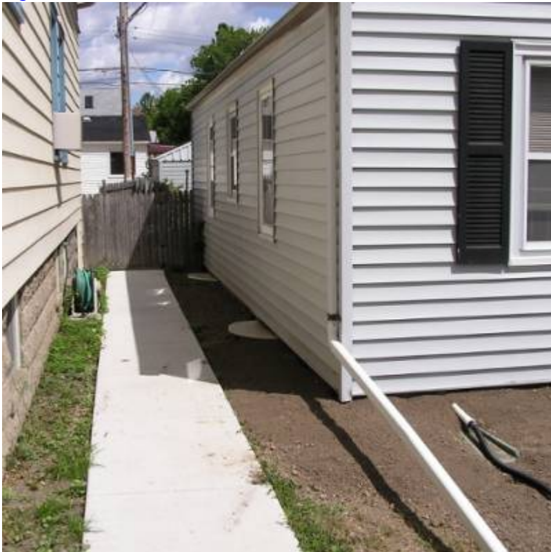
Fig. 4. 3700 Oklahoma.