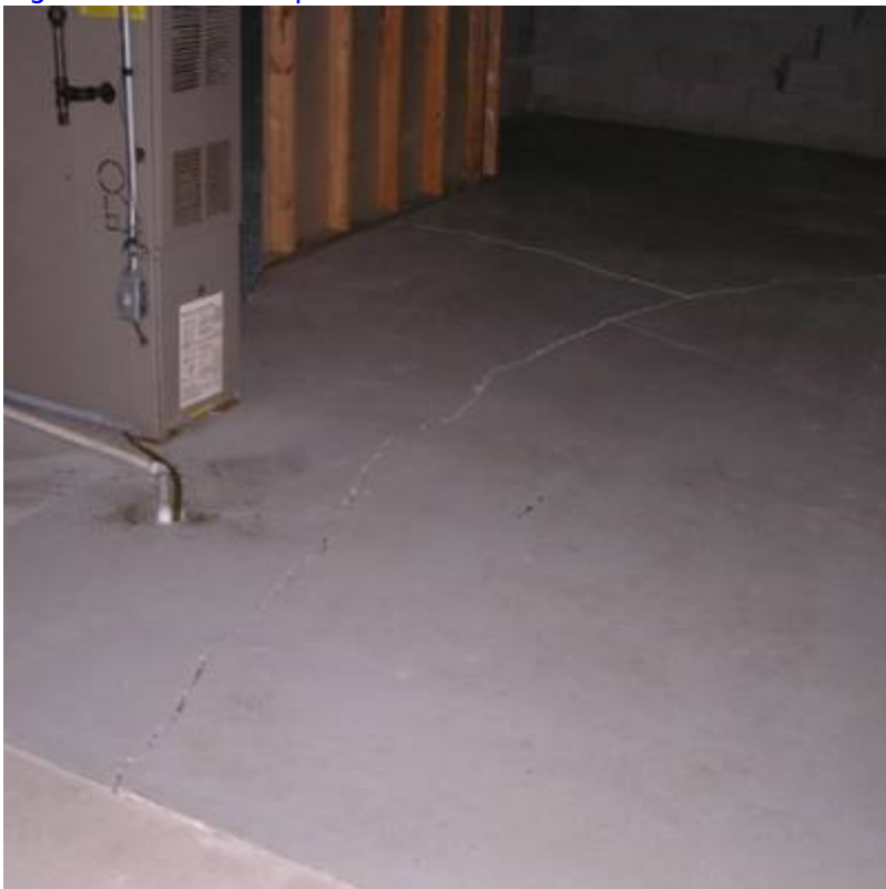
Fig. 12. 7141-43 Duplex.