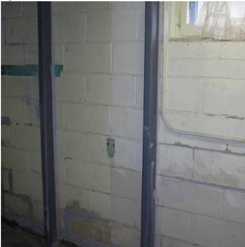
Fig. 6. 3700 Oklahoma.