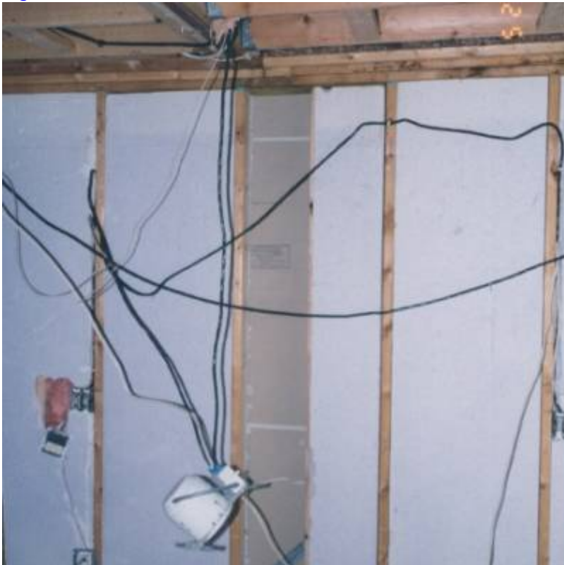
Fig. 3. Klimo residence.