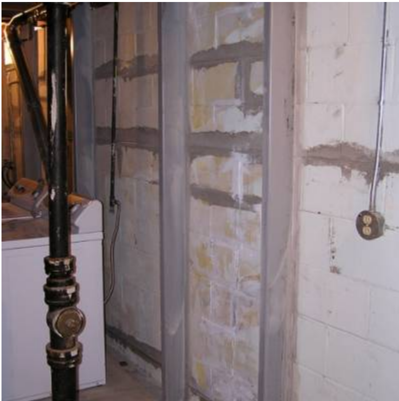
Fig. 2. Schneider residence.