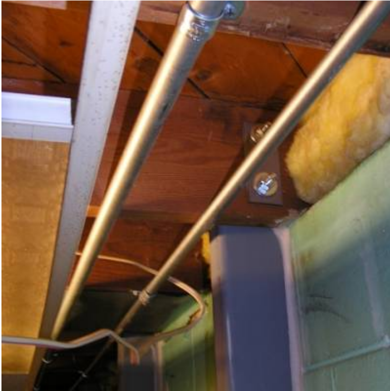
Fig. 11. 3700 Oklahoma.