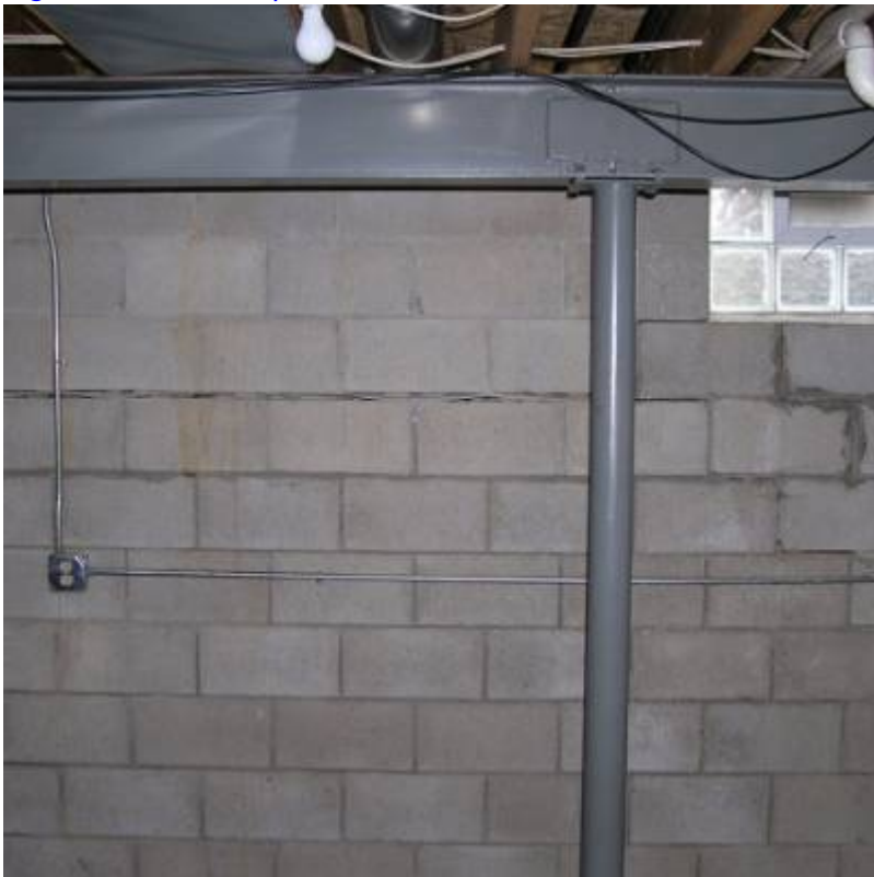
Fig. 10. 7141-43 Duplex.