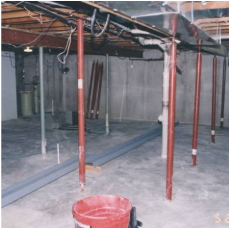
Fig. 1. Klimo residence.