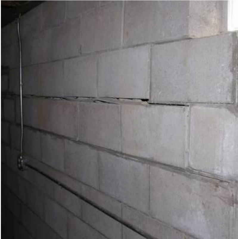
Fig. 11. 7141-43 Duplex.