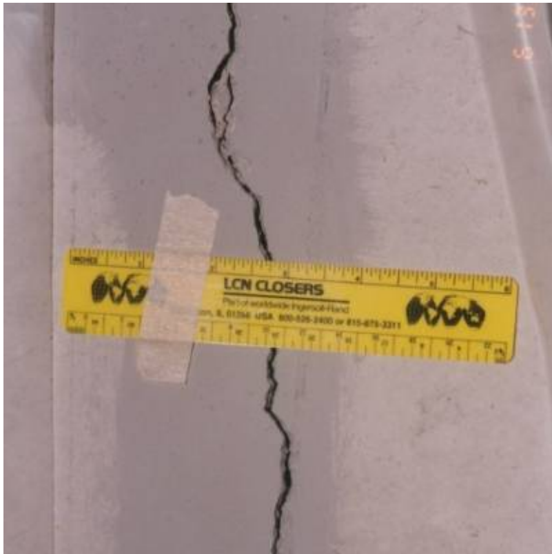
Fig. 2. Pack residence.