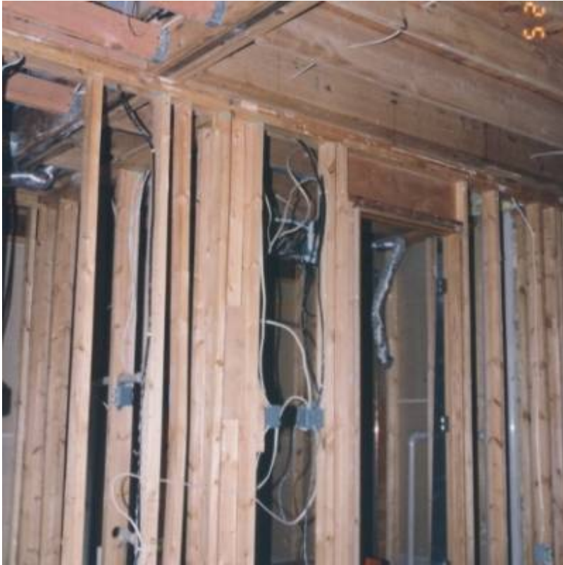
Fig. 2. Klimo residence.