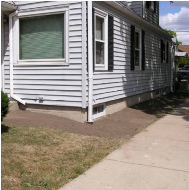
Fig. 1. 3700 Oklahoma.