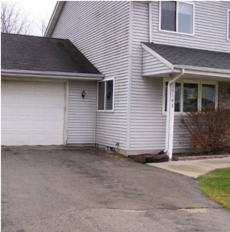
Fig. 3. 7141-43 Duplex.