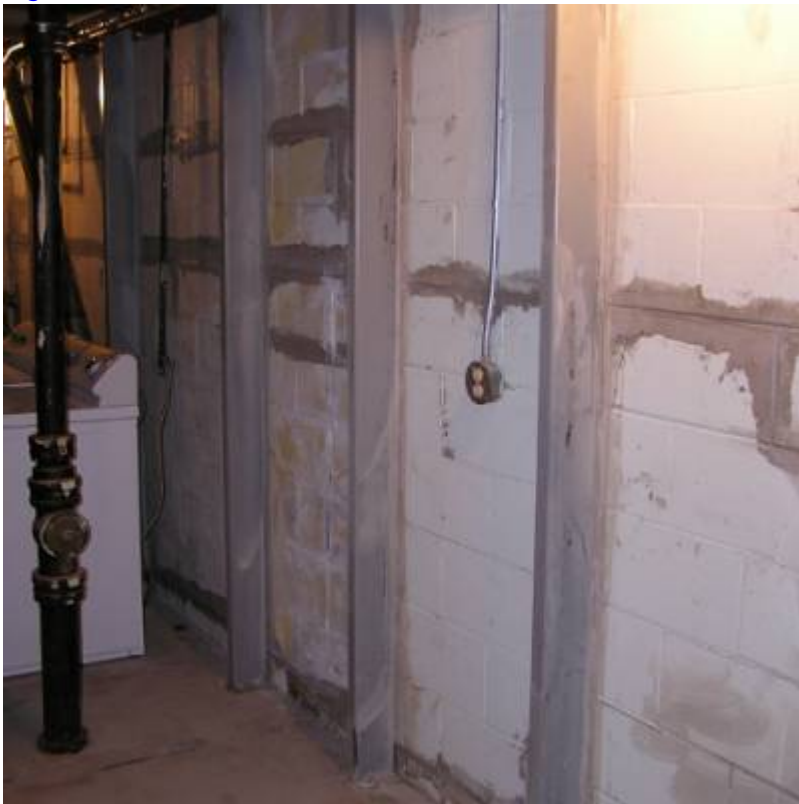
Fig. 3. Schneider residence.