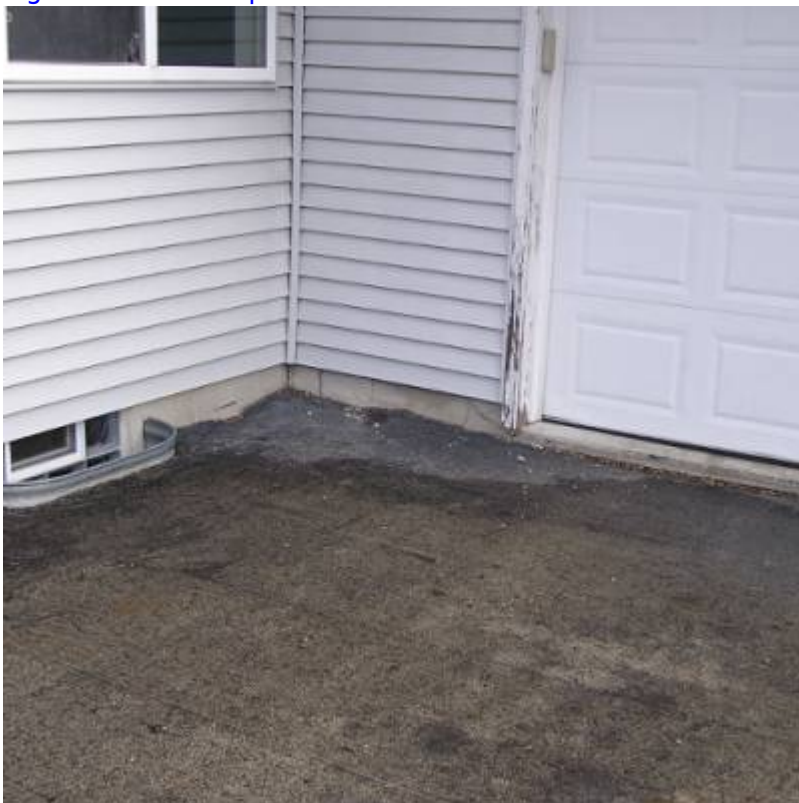
Fig. 2. 7141-43 Duplex.