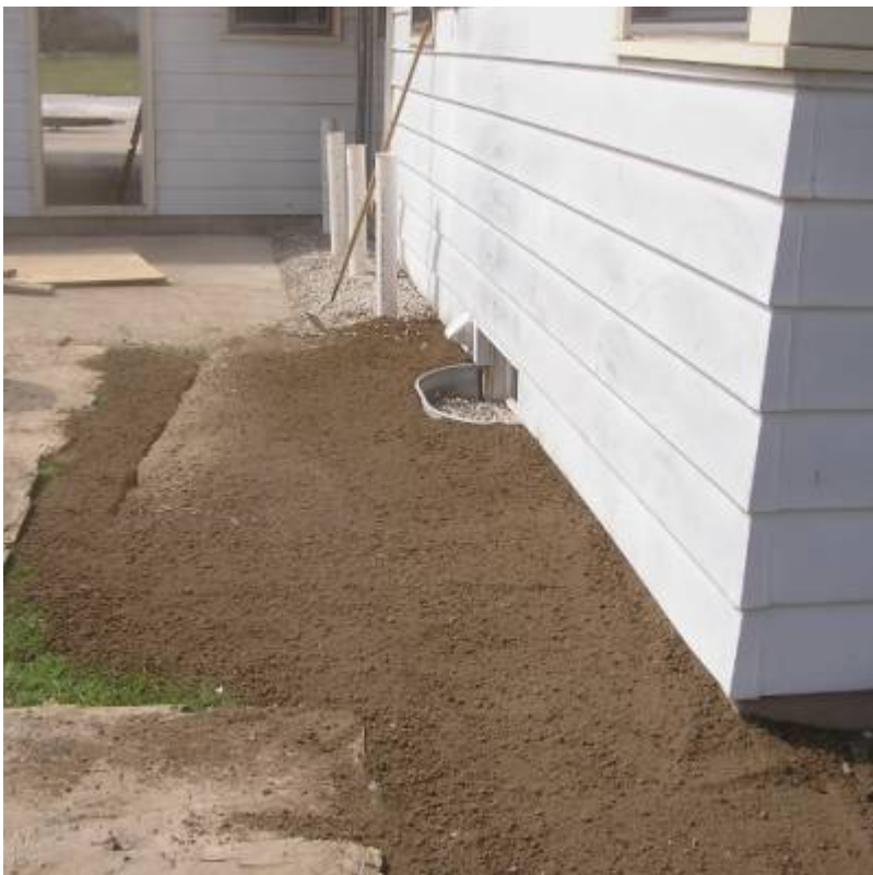
Fig. 1. Schneider residence.