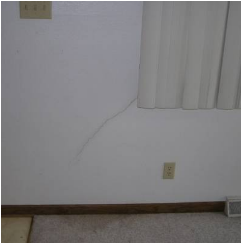
Fig. 5. 7141-43 Duplex.