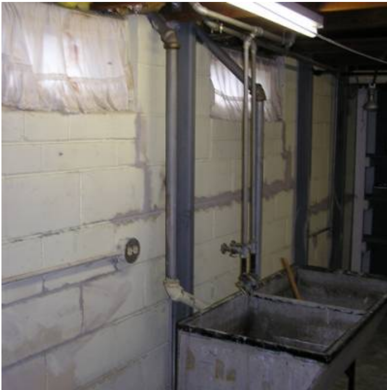
Fig. 5. 3700 Oklahoma.