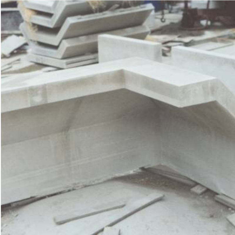
U.S. Holocaust Memorial Museum