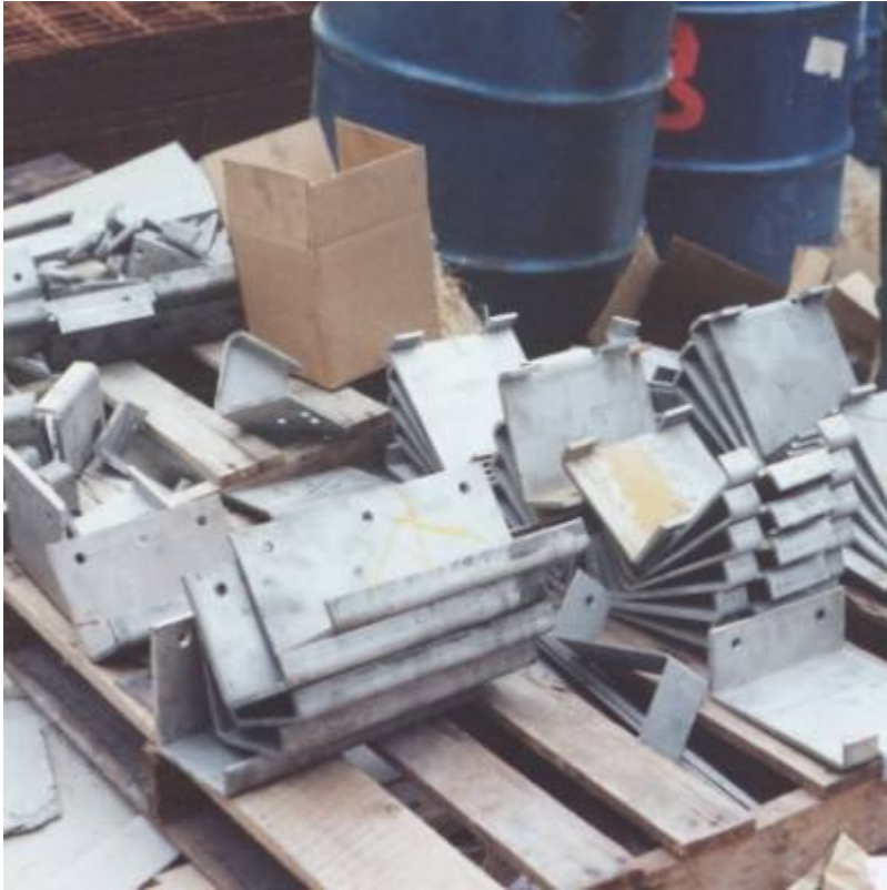
U.S. Holocaust Memorial Museum