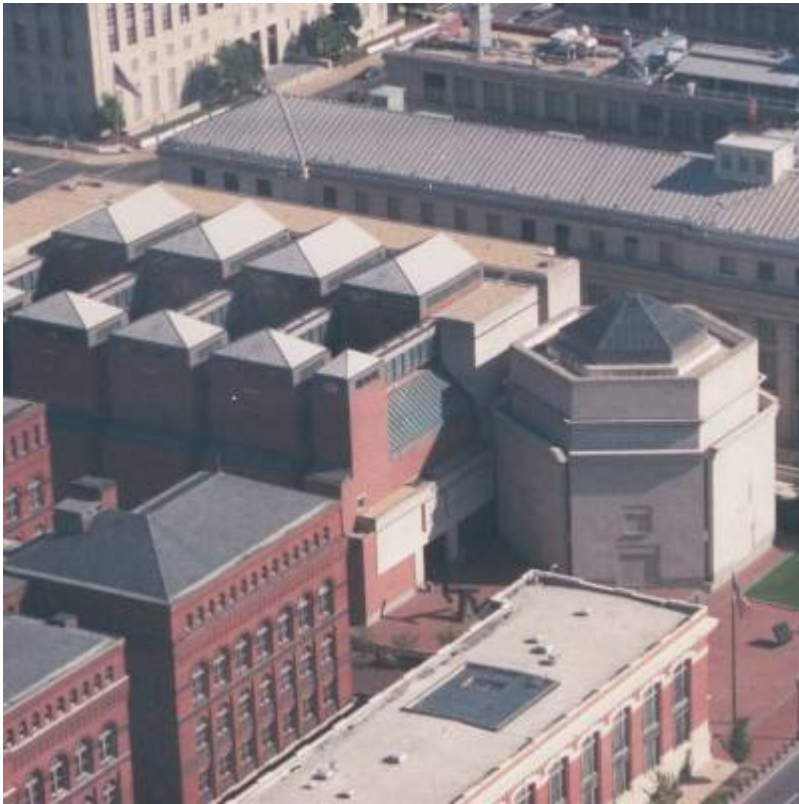
U.S. Holocaust Memorial Museum