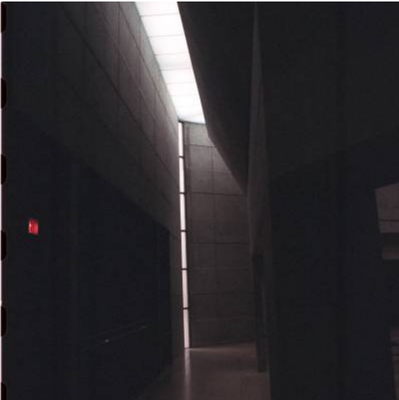
U.S. Holocaust Memorial Museum