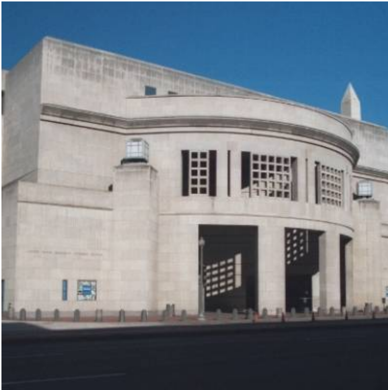
U.S. Holocaust Memorial Museum