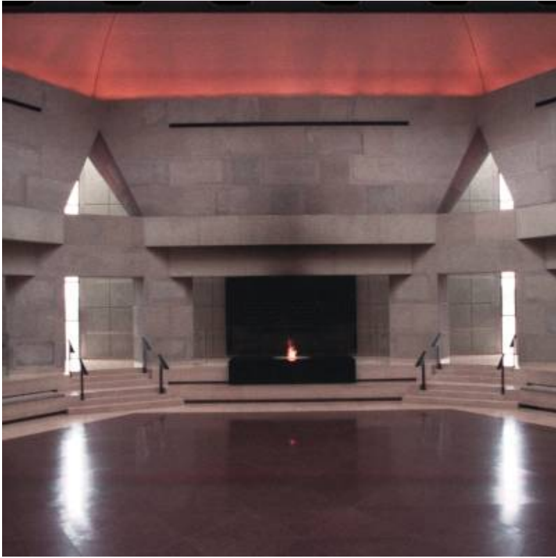
U.S. Holocaust Memorial Museum