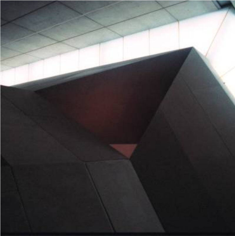
U.S. Holocaust Memorial Museum