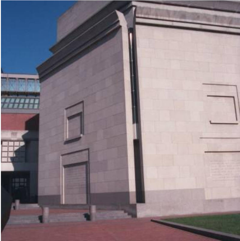
U.S. Holocaust Memorial Museum