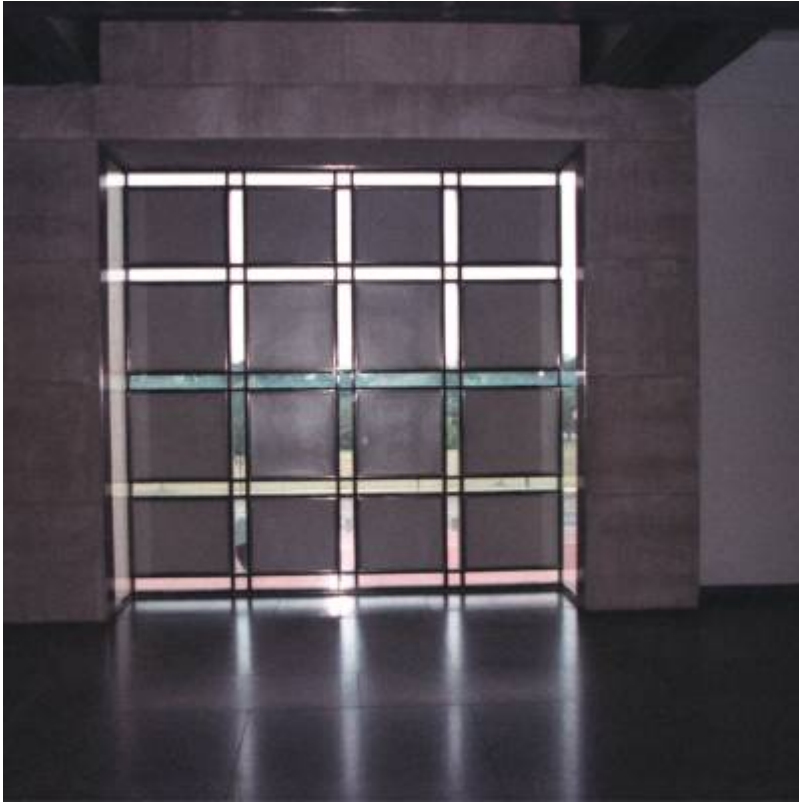
U.S. Holocaust Memorial Museum