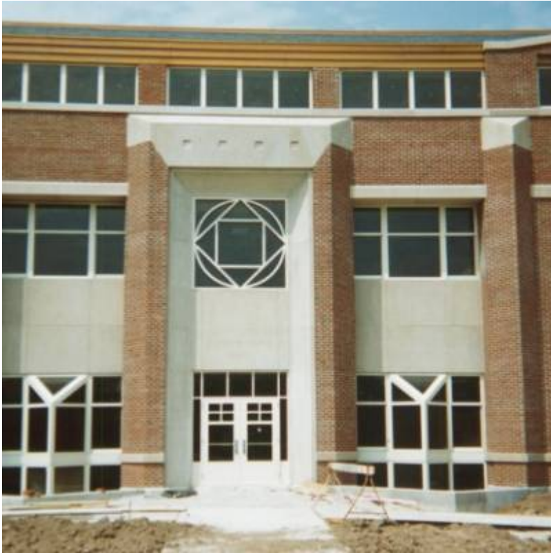
St. Norbert College