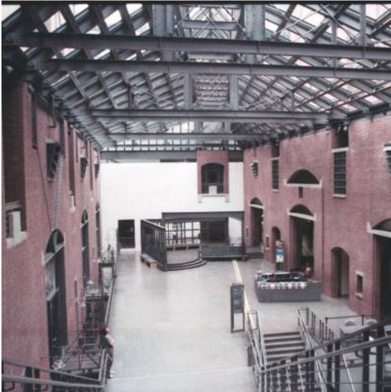
U.S. Holocaust Memorial Museum