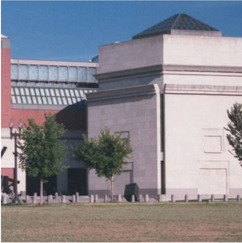
U.S. Holocaust Memorial Museum