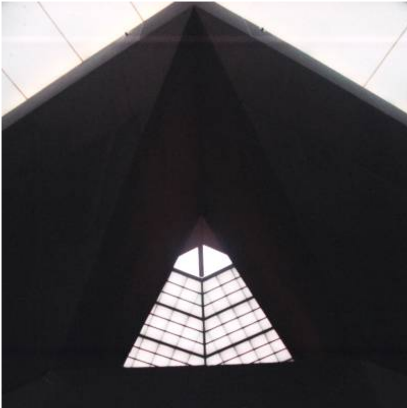
U.S. Holocaust Memorial Museum