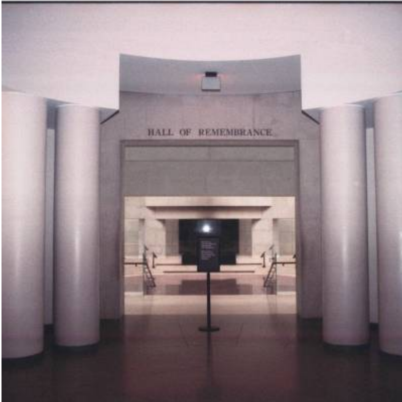
U.S. Holocaust Memorial Museum