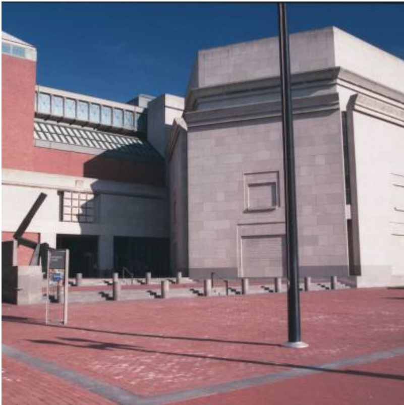
U.S. Holocaust Memorial Museum