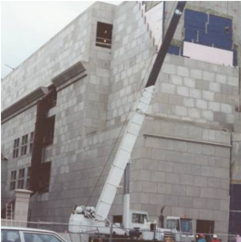
U.S. Holocaust Memorial Museum