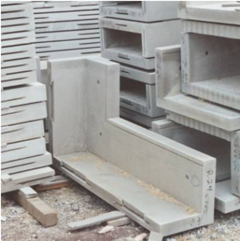
U.S. Holocaust Memorial Museum