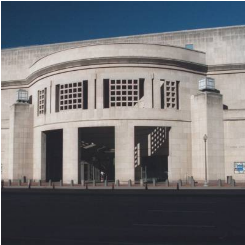
U.S. Holocaust Memorial Museum