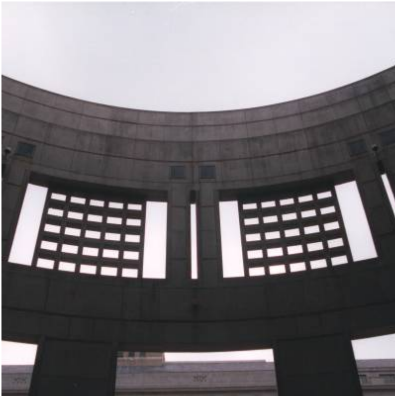
U.S. Holocaust Memorial Museum