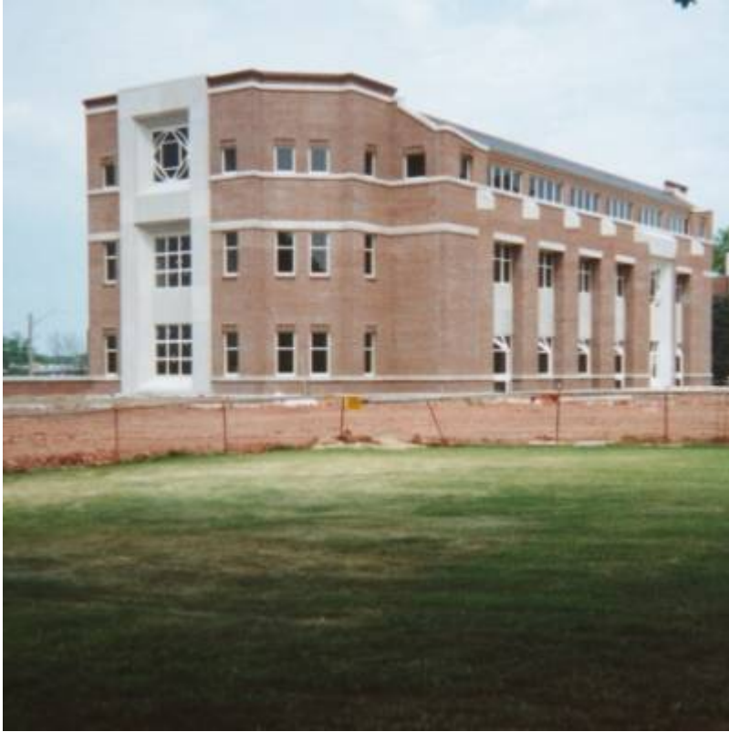
St. Norbert College