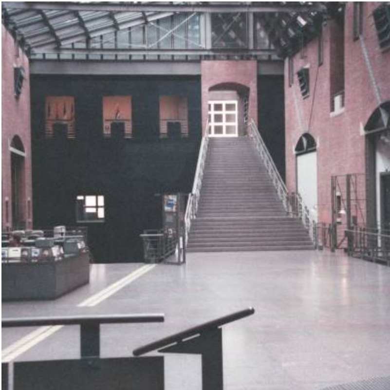
U.S. Holocaust Memorial Museum