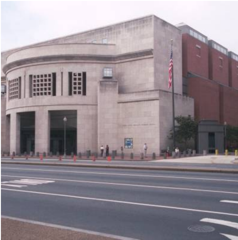
U.S. Holocaust Memorial Museum